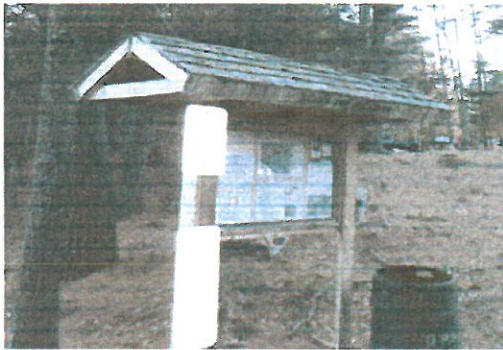
Existing Veterans Boat Ramp Kiosk