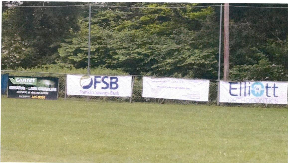
Bise Right Field