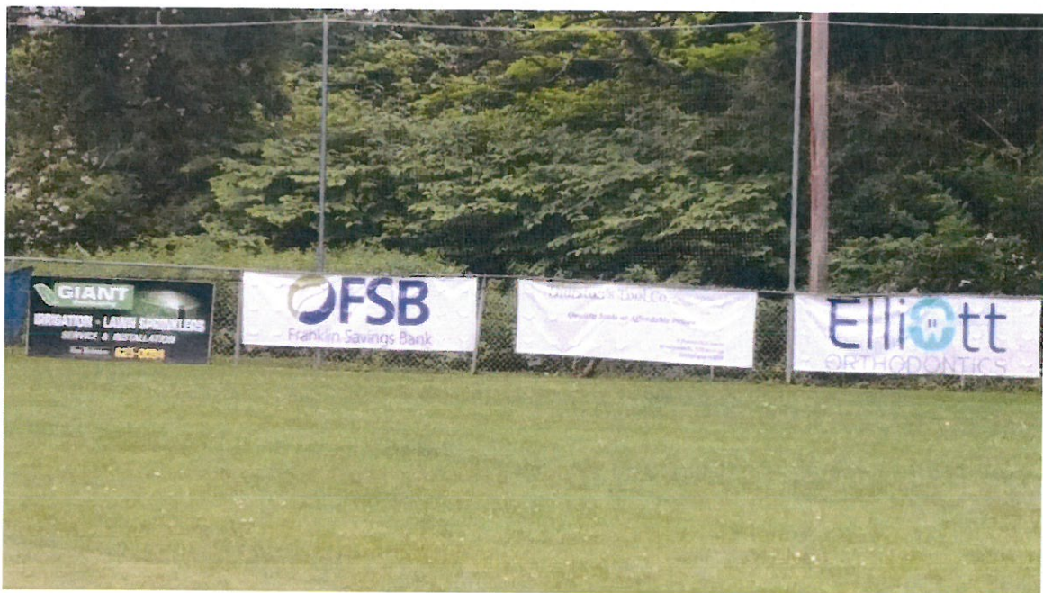
Bise Right Field