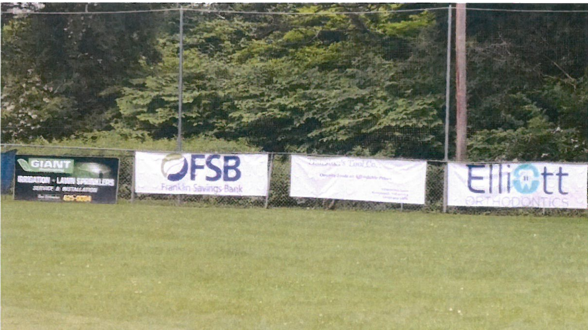
Bise Right Field