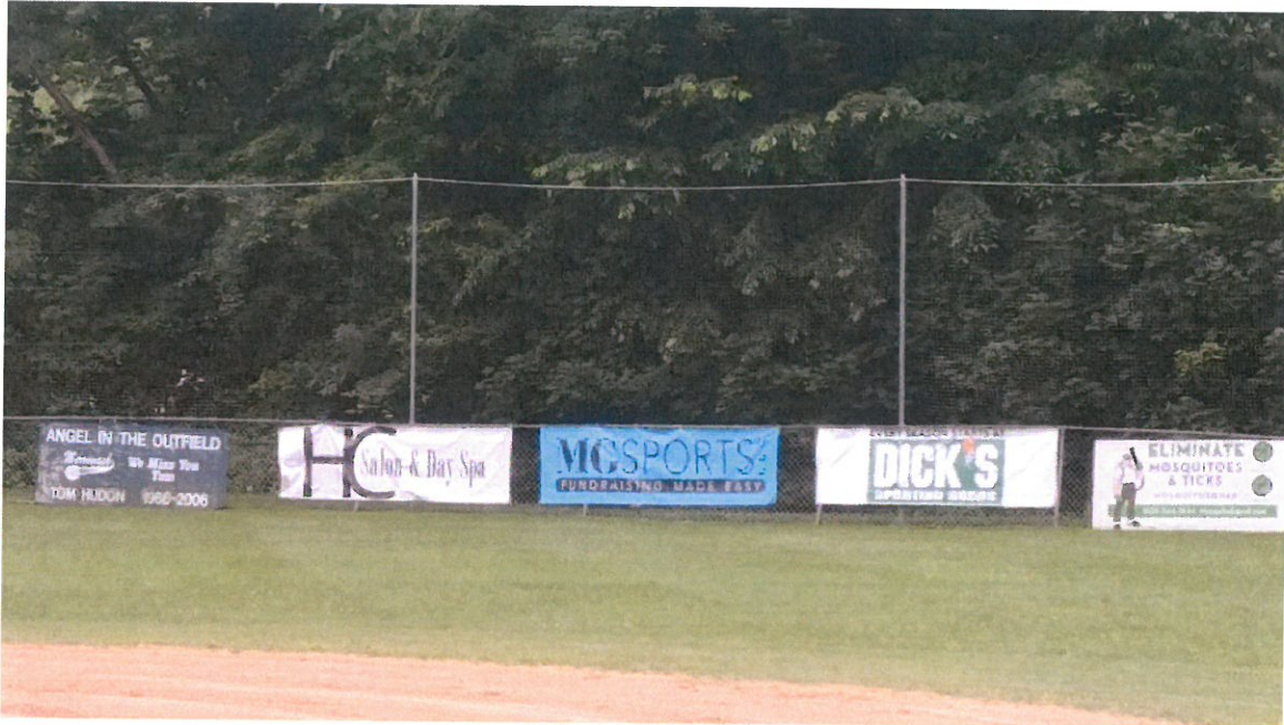
Bise Left Field