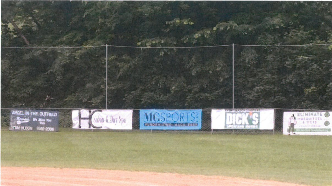
Bise Left Field