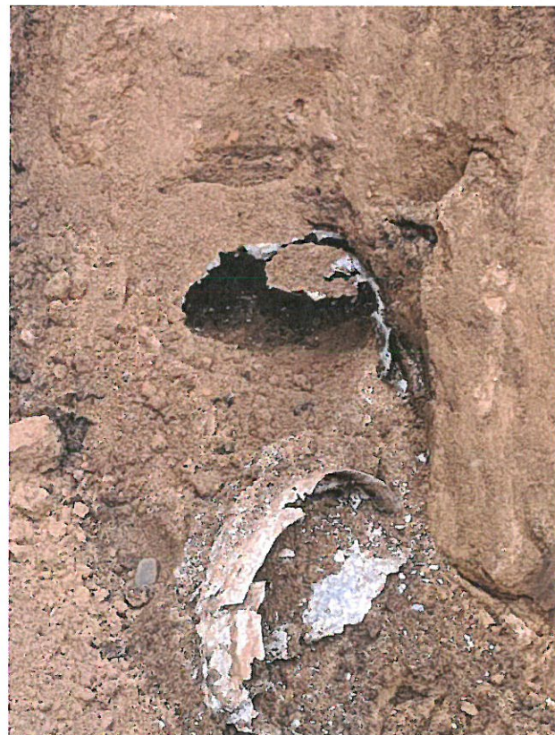
Deteriorated CMP (Metal Pipe) (8/25/2020)