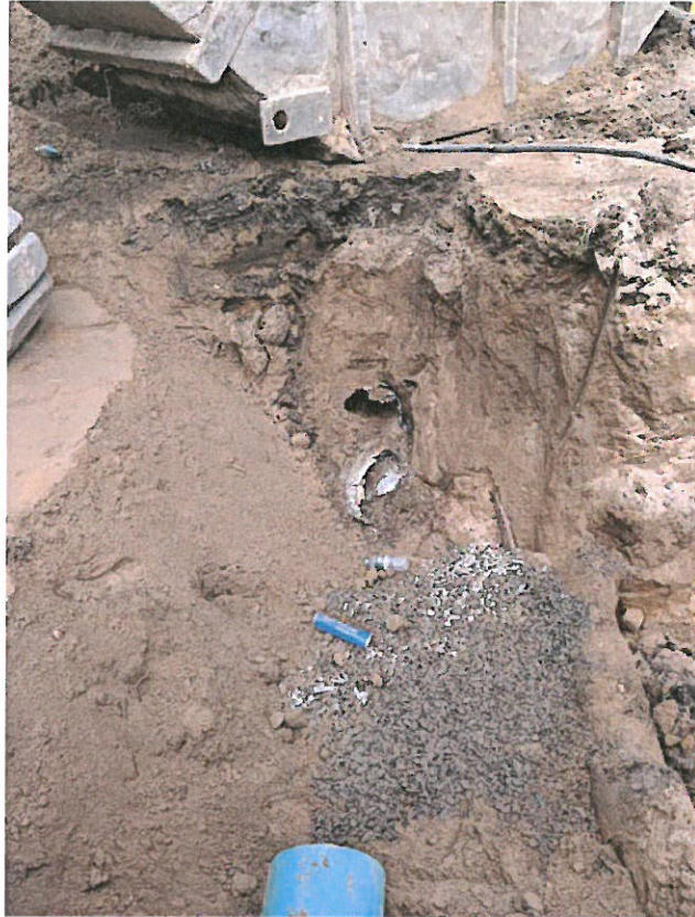
Broken Drainage line (8/25/2020)