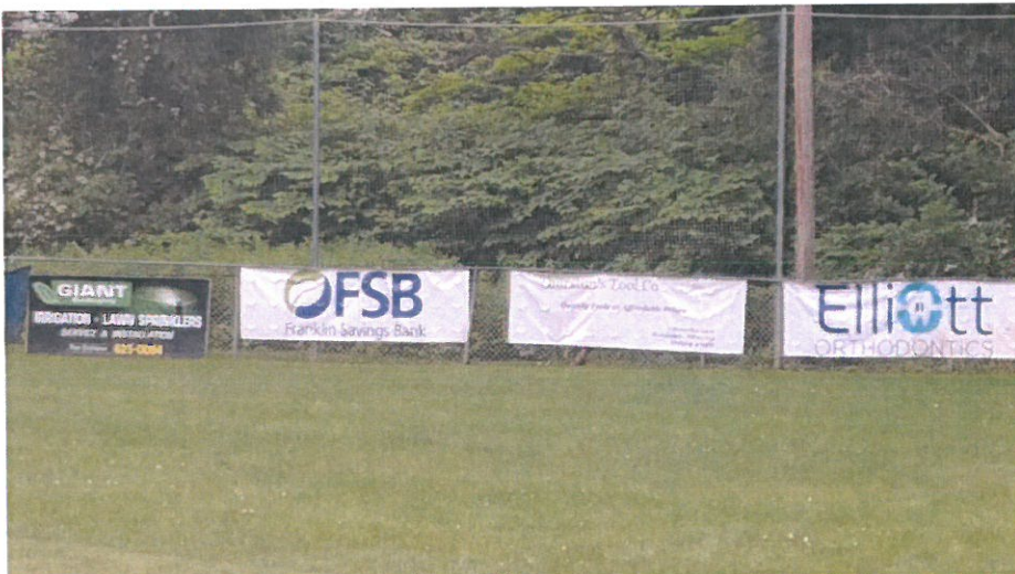
Bise Right Field