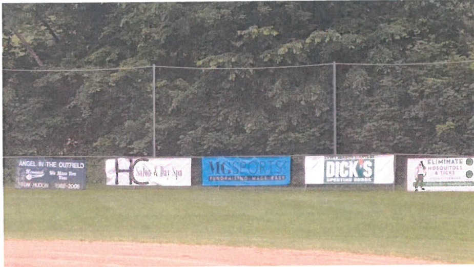
Bise Left Field