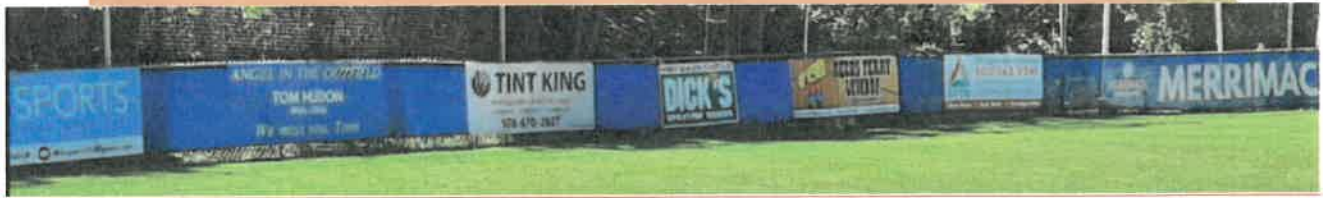
Bisefield Left Field