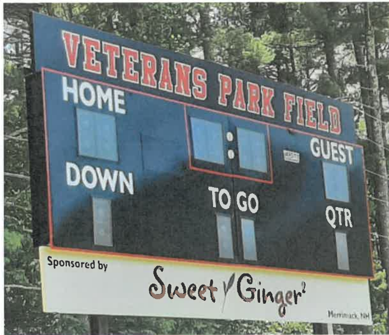
Veterans Park Scoreboard Veterans Park