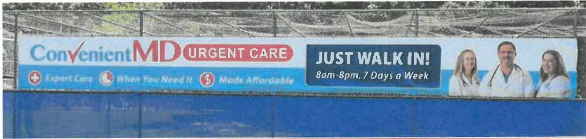
Bise Field Bullpen