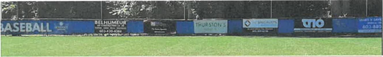
Bise Field Right Field