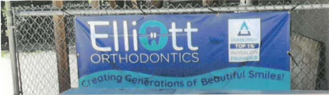
Bise Field Concession Stand