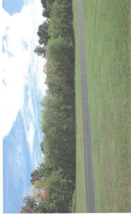
East Side of the Field