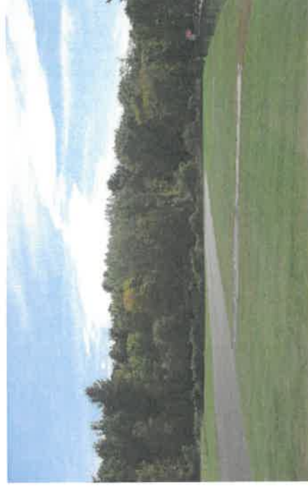
South End Approach