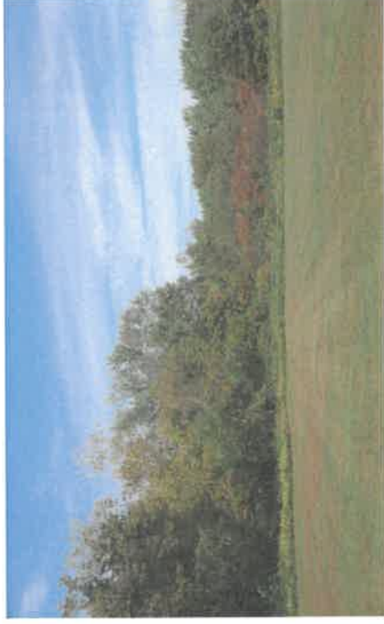
North End Trees