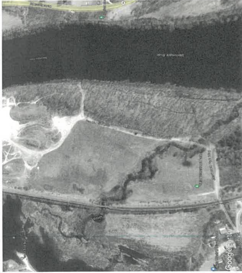
Patterson Field 1992