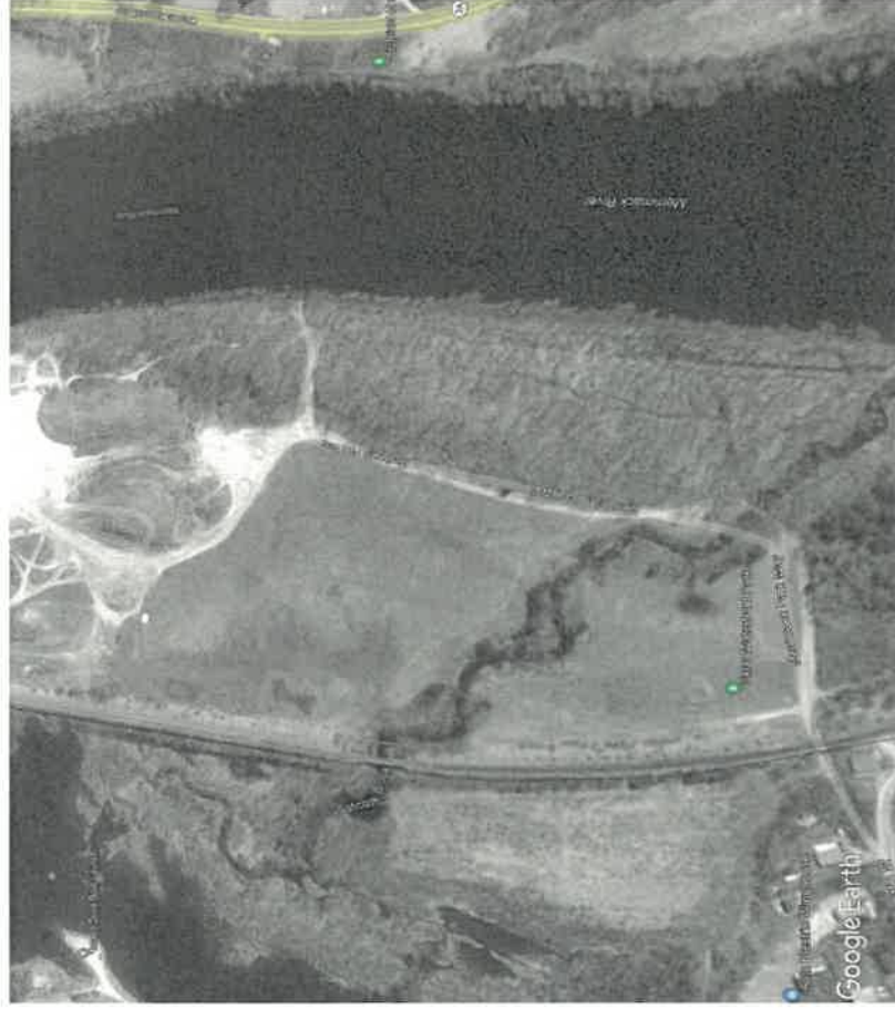
Patterson Field 1992