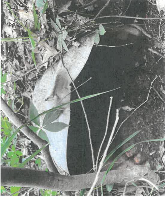
West end of culvert.