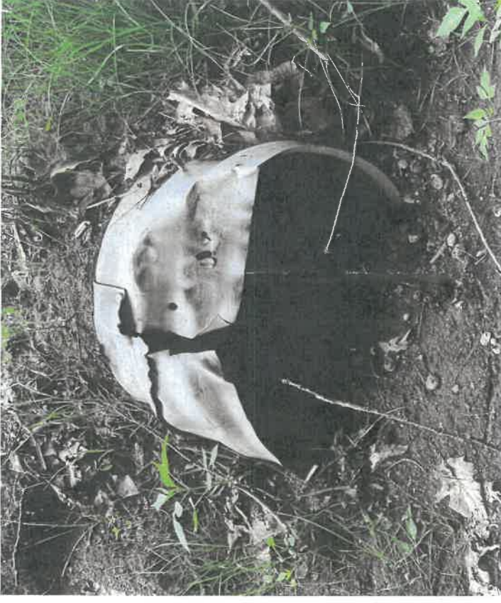
East end of culvert.