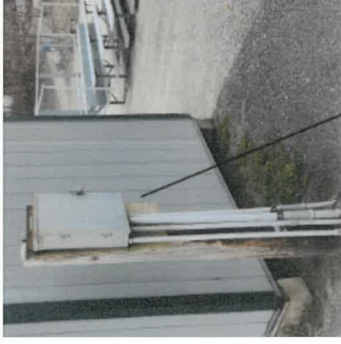
There might be power right behind it