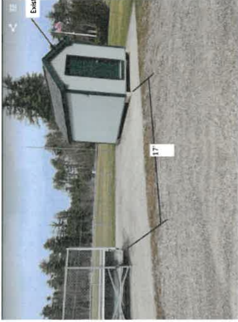
Existing shed is 8'0x.12'1'

Between the existing baseball shed and the bleachers, by moving the bleachers about 5 Ft to the left