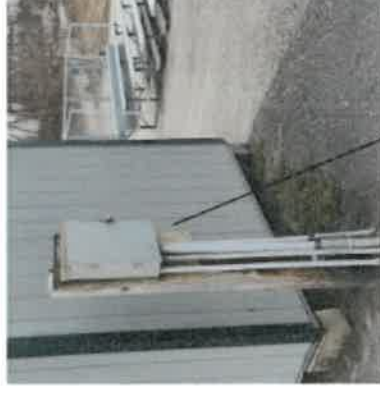
There might be power right behind it