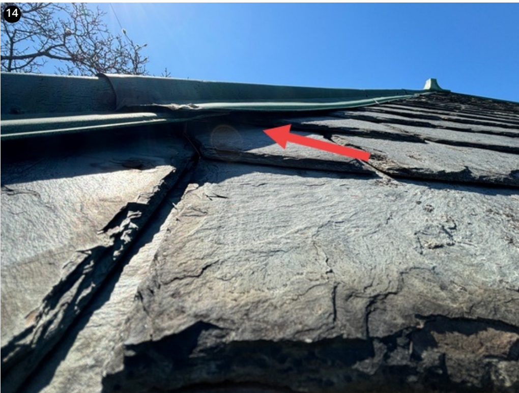
Lifting edge metal.