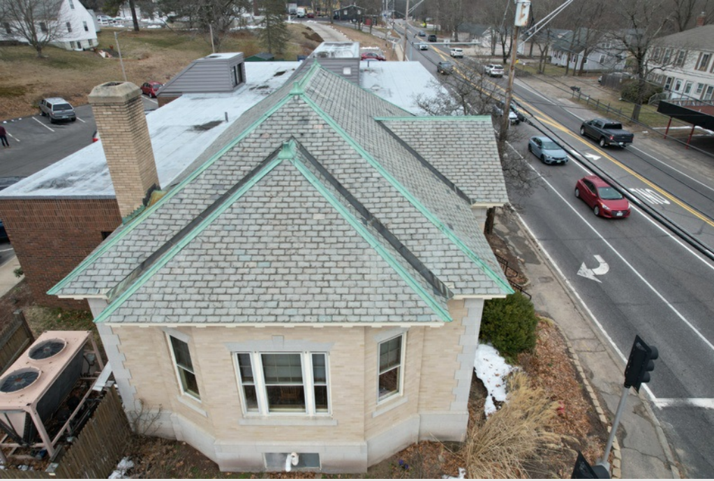
Overview of slate roof.