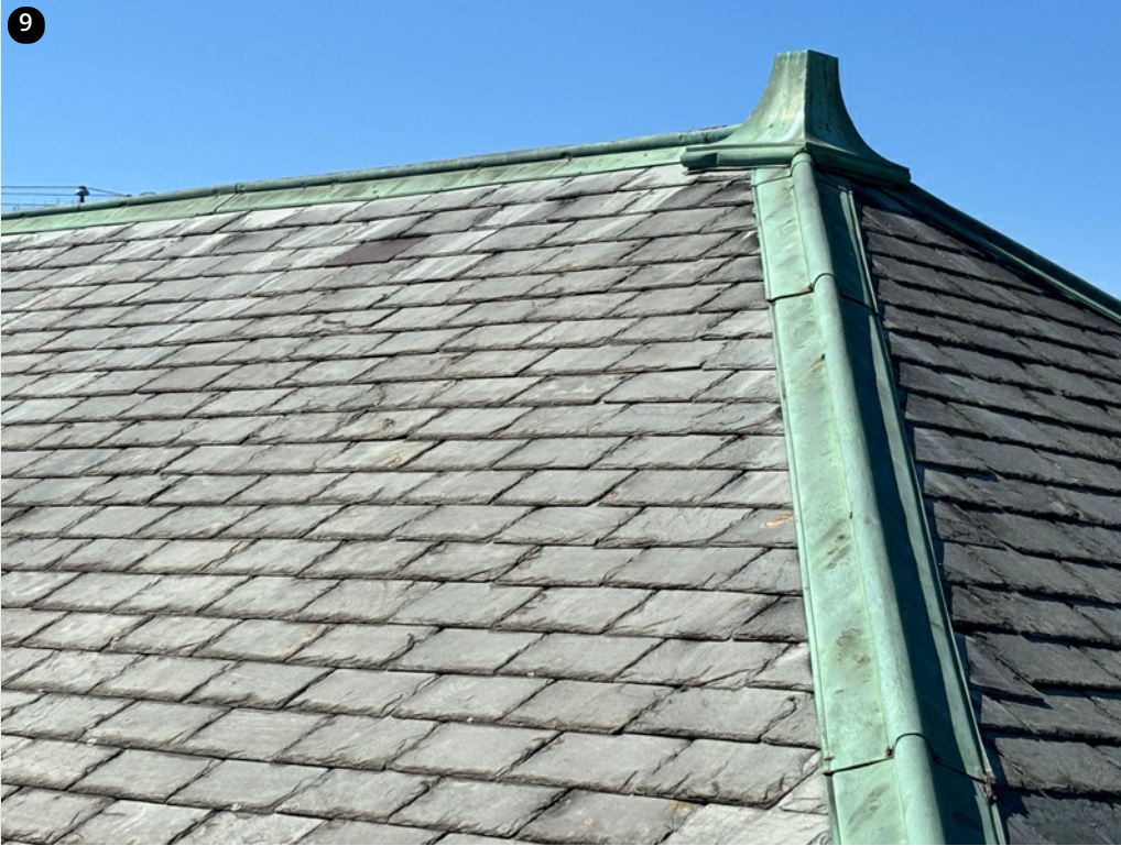
Overview photo of Eastern facing slate roof section.