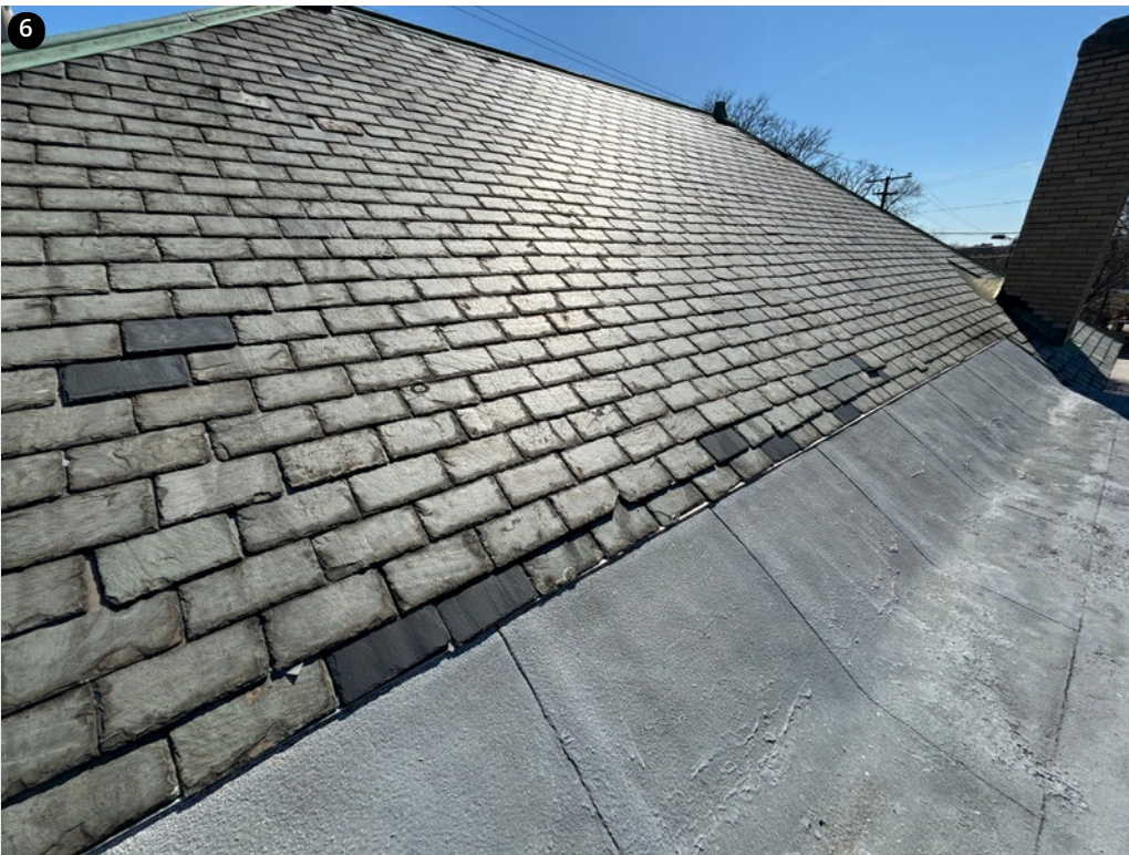
Overview photo of the Western facing slate roof section.