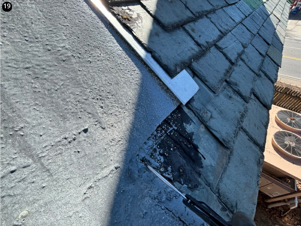
Open conditions throughout slate to modified transitions.