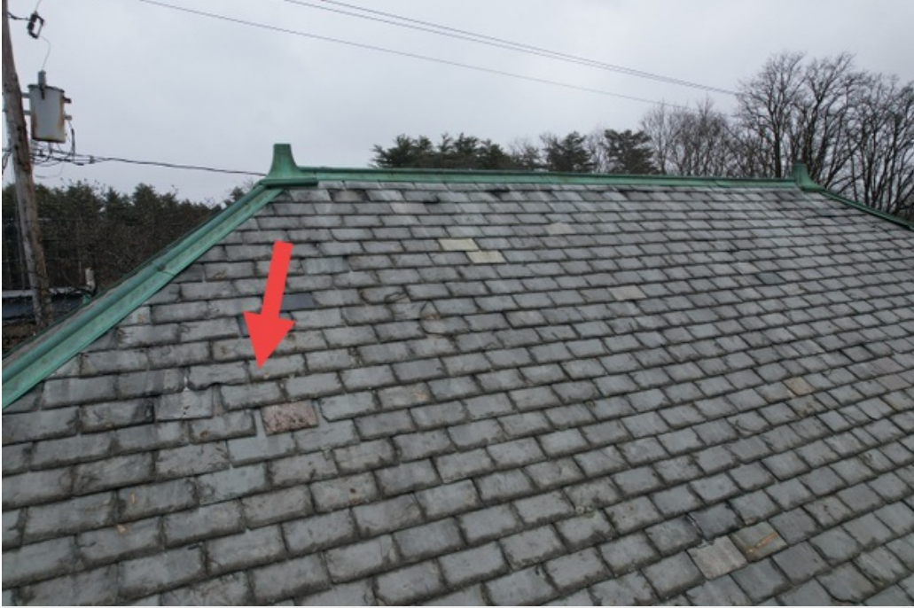
Area of loose slate.