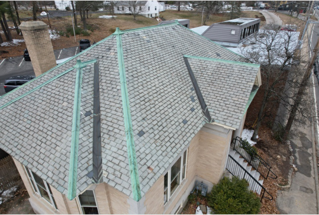
Overview of slate roof.