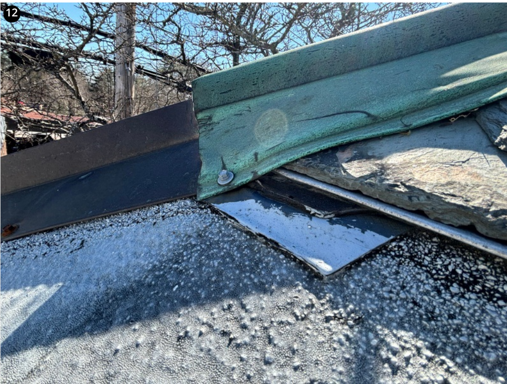
Open conditions throughout edge metal.