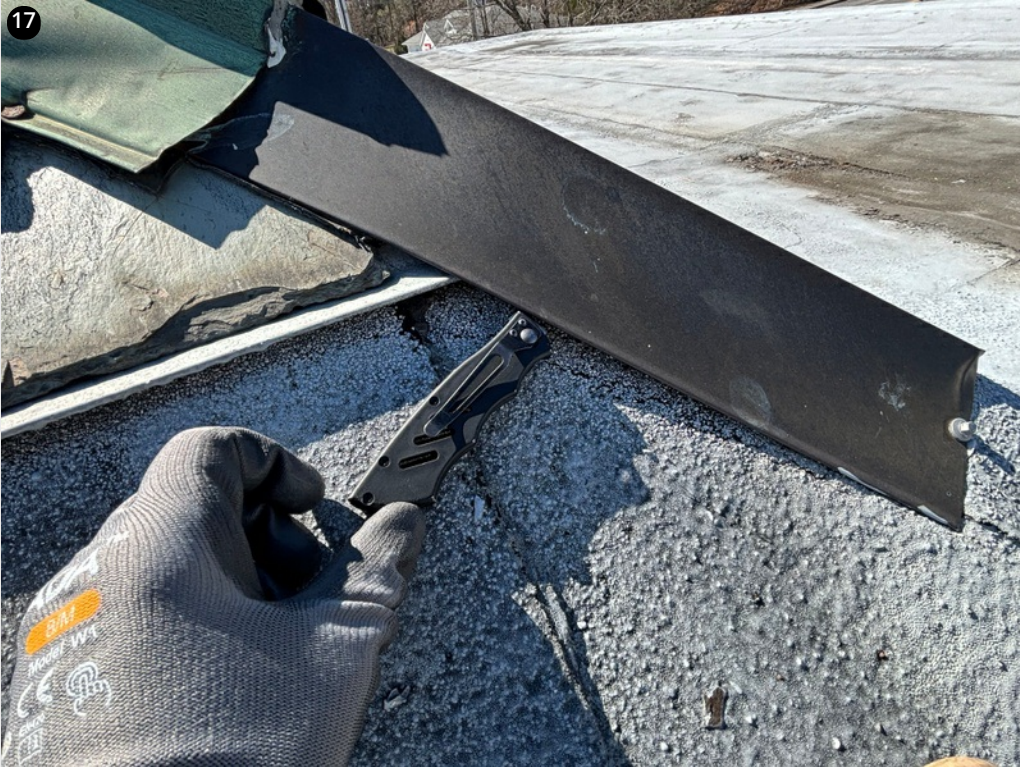
Open conditions at transition.