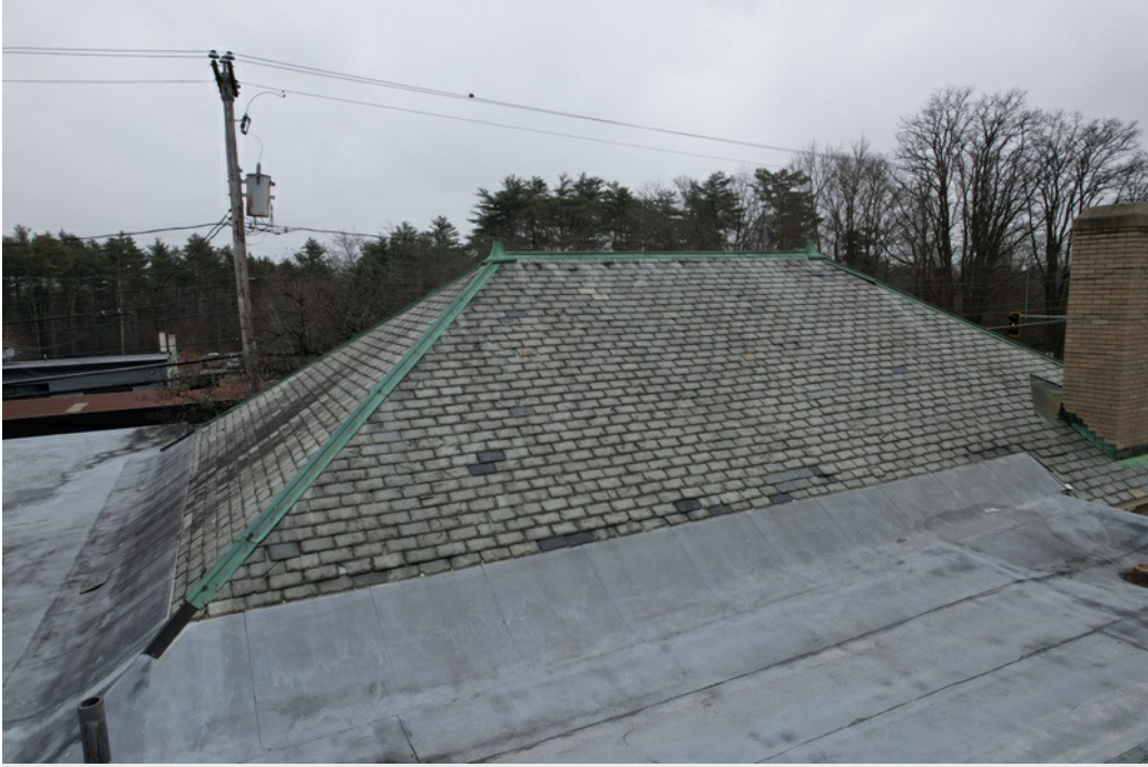
Overview of slate roof.