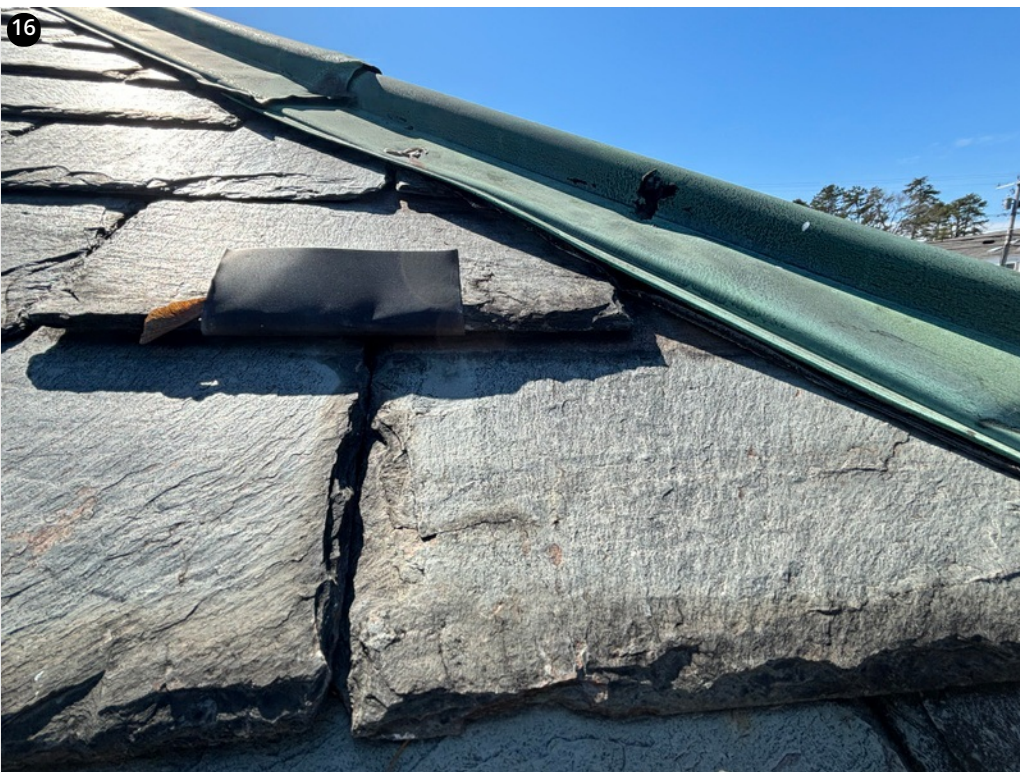
Areas throughout edge metal not secured.