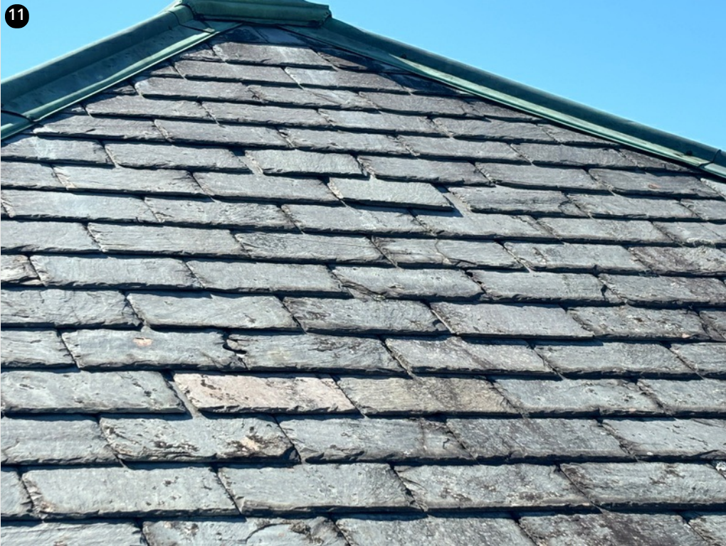
Loose slate throughout roof sections.