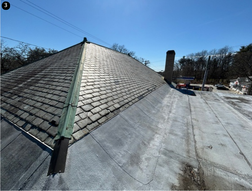
Overview photo facing South.