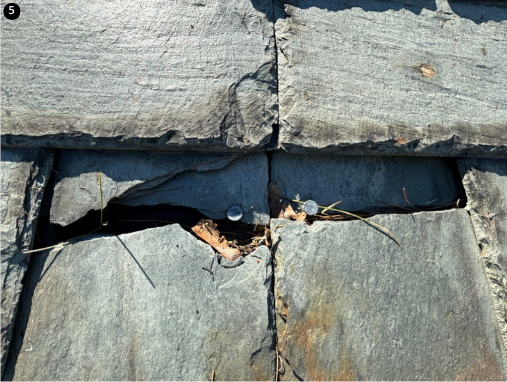
Exposed fasteners above leak area.