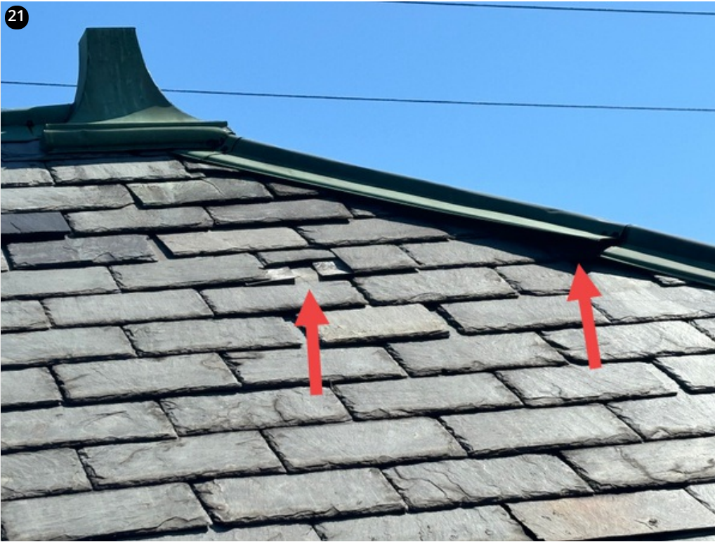
Slate shingle shifted and edge metal lifting.