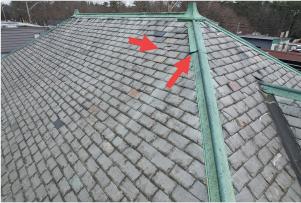
Loose metal cap. Missing slate.