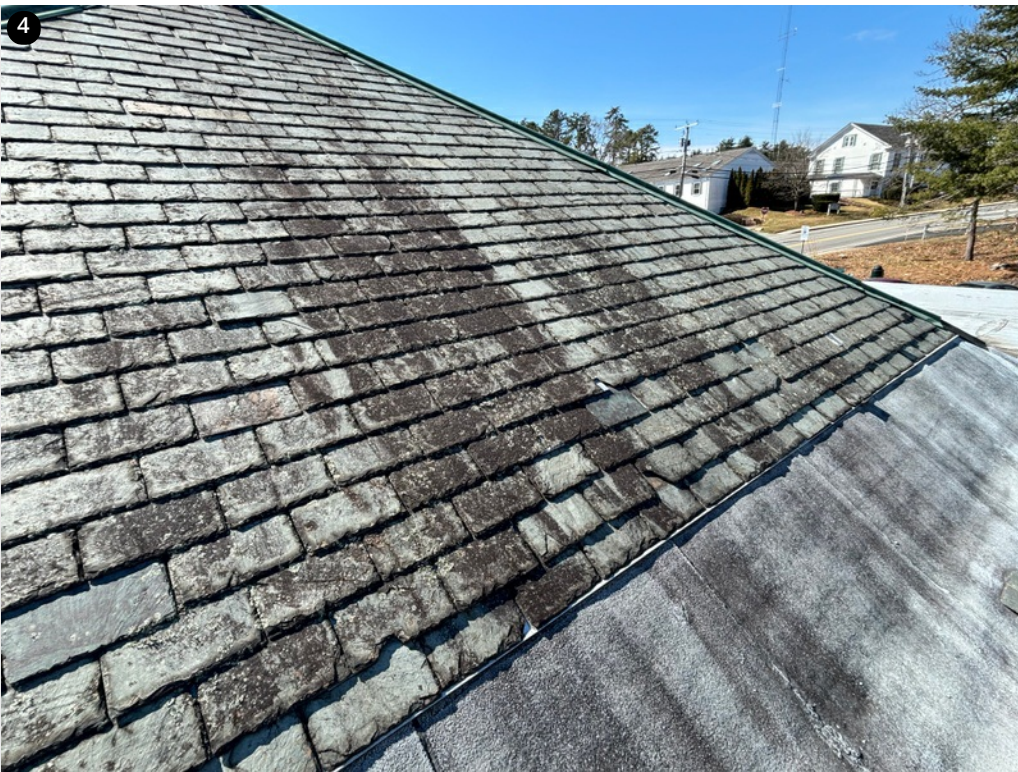
Overview photo of above leak area. Deterioration found throughout slate roof sections.