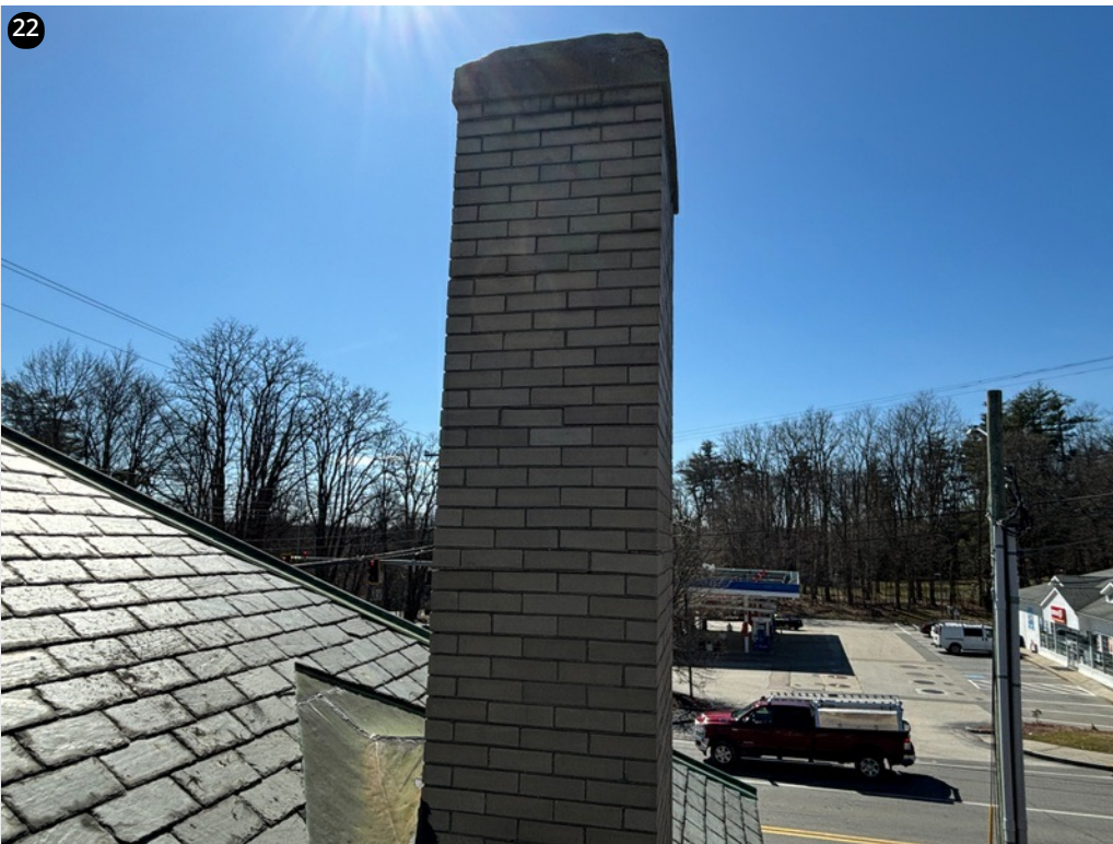
Masonry joints on chimney are showing deterioration.