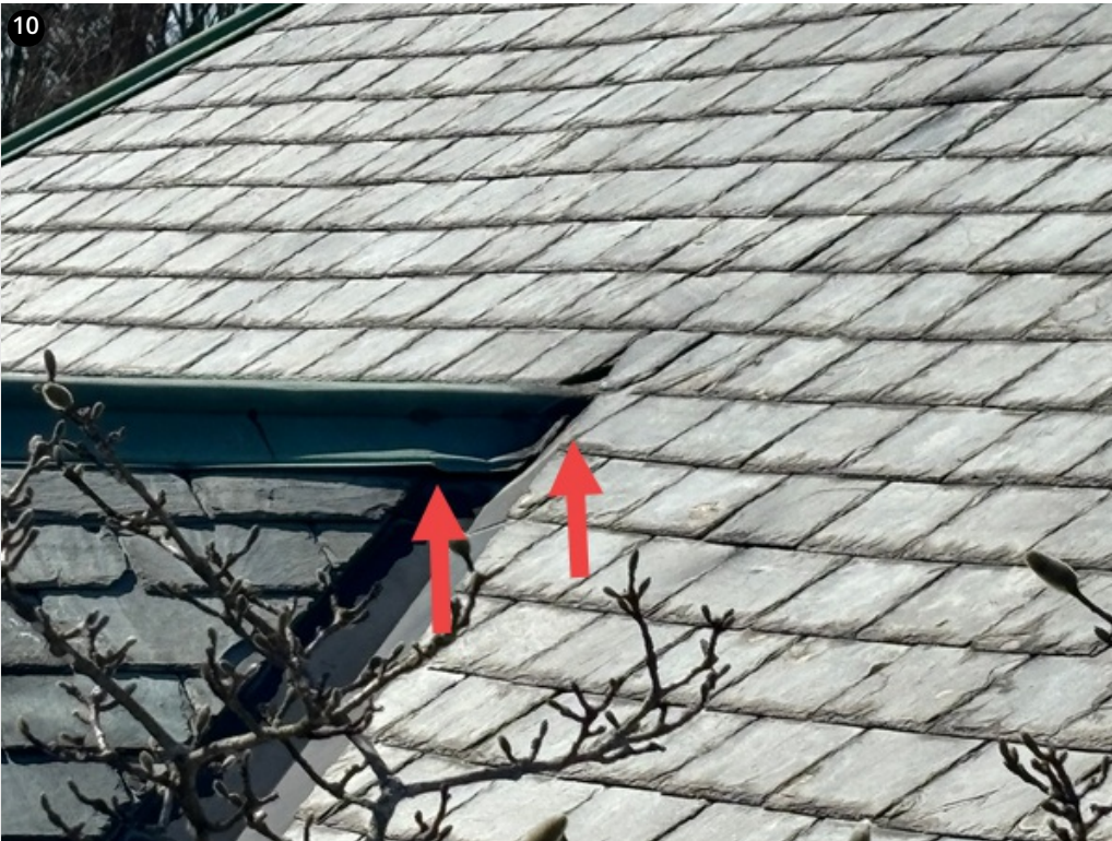
Open conditions throughout edge metal.