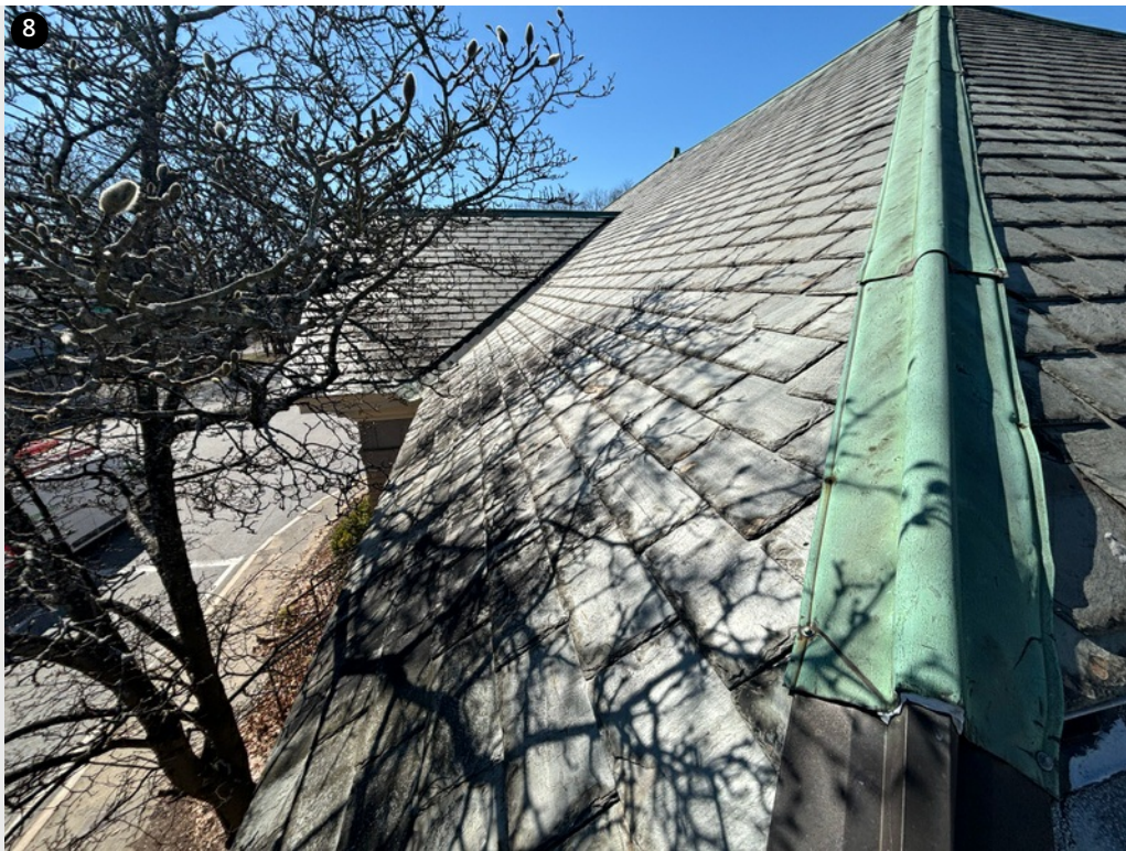
Overview photo of the Eastern facing slate roof section.