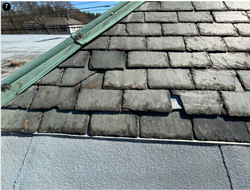
Broken slate on Western facing section.