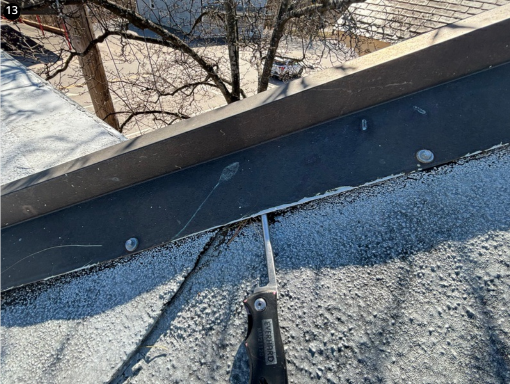
Open conditions throughout edge metal.