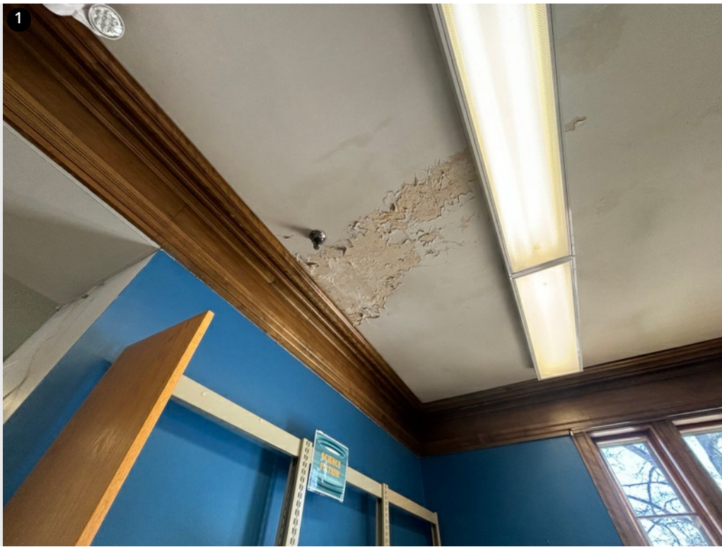
1 Interior leak presenting under the Northern facing section of slate roof.