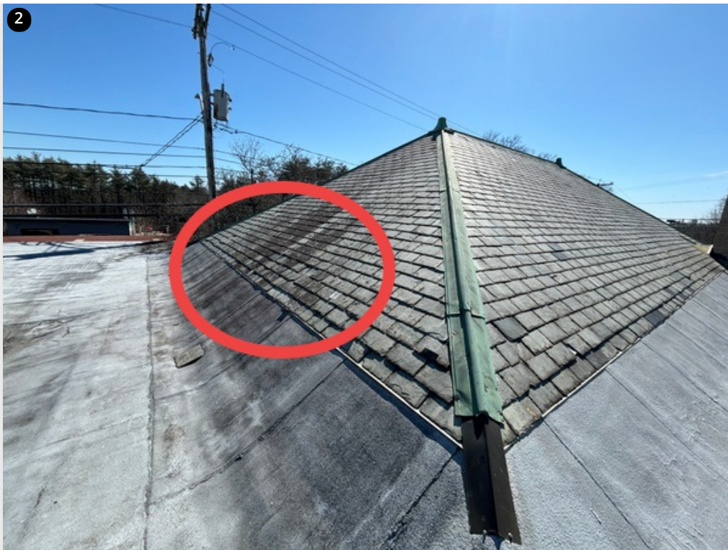
2 Leak area highlighted. Overview photo of Northern most slate roof section. Slate missing and damaged throughout all slate roof sections.