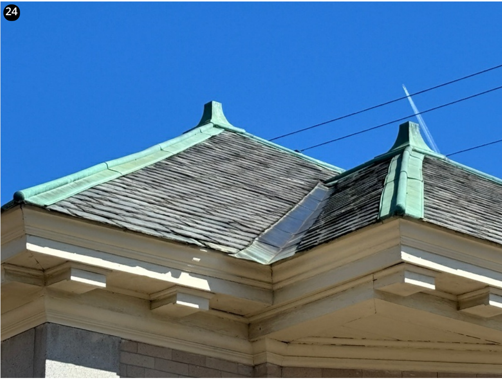
Photo showing South facing slate roof section.