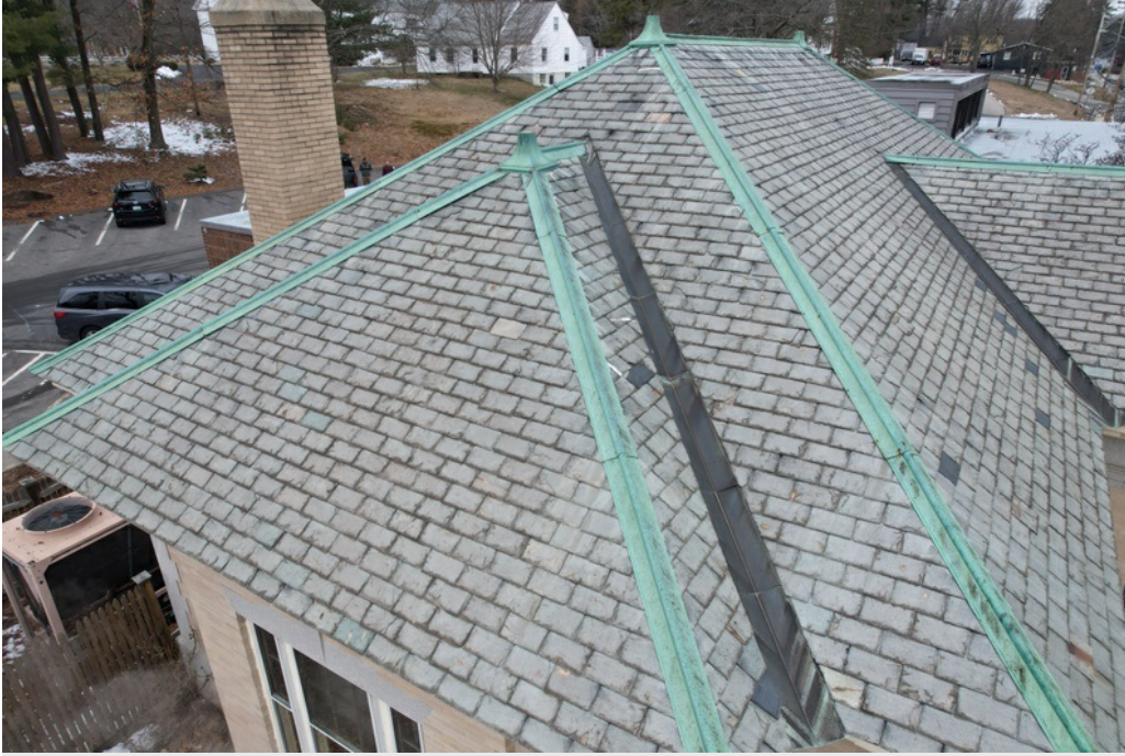
Overview of slate roof.