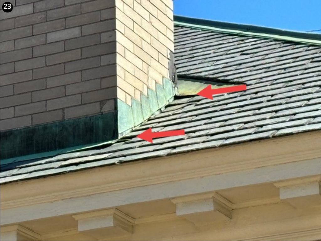
Possible open conditions around masonry step flashing.